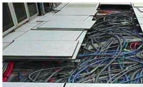
Typical Data Center with Power Cables and Conduit