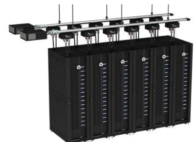
Data Center with Vertiv™ PowerBar iMPB